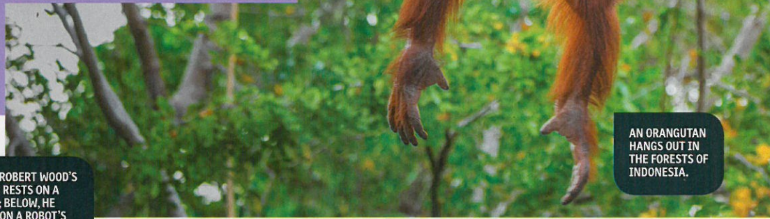
AN ORANGUTAN HANGS OUT IN THE FORESTS OF INDONESIA.

STUDY Biology and ecology WATCH Dr. Seuss’ The Lorax READ My Life With the Chimpanzees by Jane Goodall